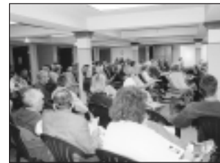
The October program featuring Historic Survey of Wayzata properties was presented at the Meridian Manor.